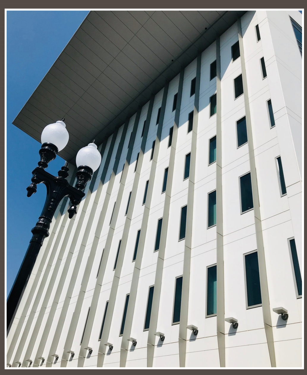
One of our staff took this photo of the County Administration South building during a walk through the civic center in Santa Ana.

This section will feature photos taken by department employees while they were out and about to help close our newsletter on a good visual note.