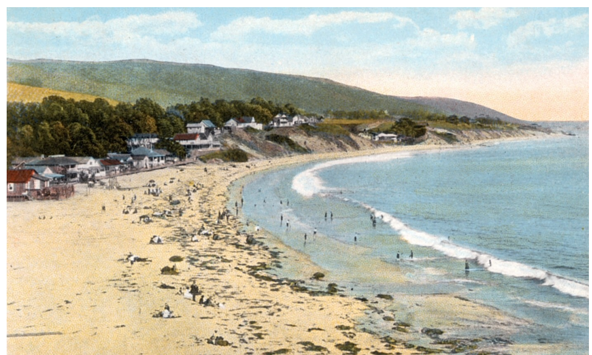
Laguna Beach became a city on June 29, 1927 – which is about when this postcard image was made. At the time, the town had a population of only 1,900.

June 04,1889: Locals voted to separate from Los Angeles County and form Orange County. The vote was 2,505 to 499.