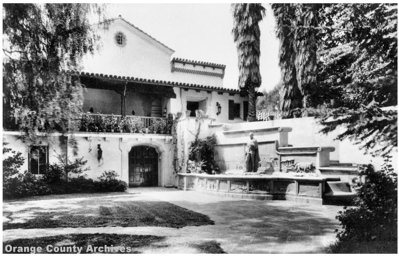
On February 15, 1936, Bowers Museum opened in Santa Ana.

February 02, 1848 Orange County, along with the rest of California, was ceded to the United States by Mexico in the Treaty of Guadalupe-Hidalgo.