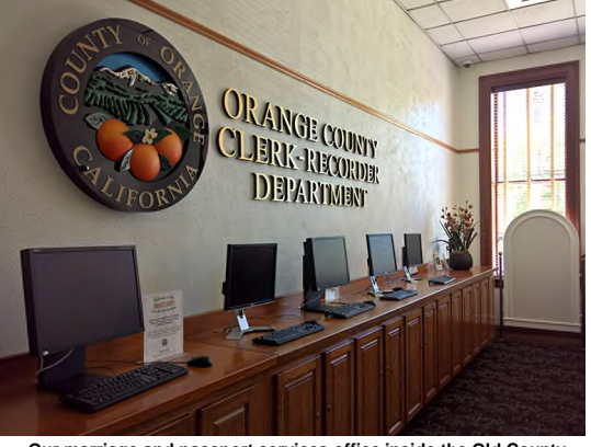
Our marriage and passport services office inside the Old County Courthouse is open during our once-a-month Saturday openings.