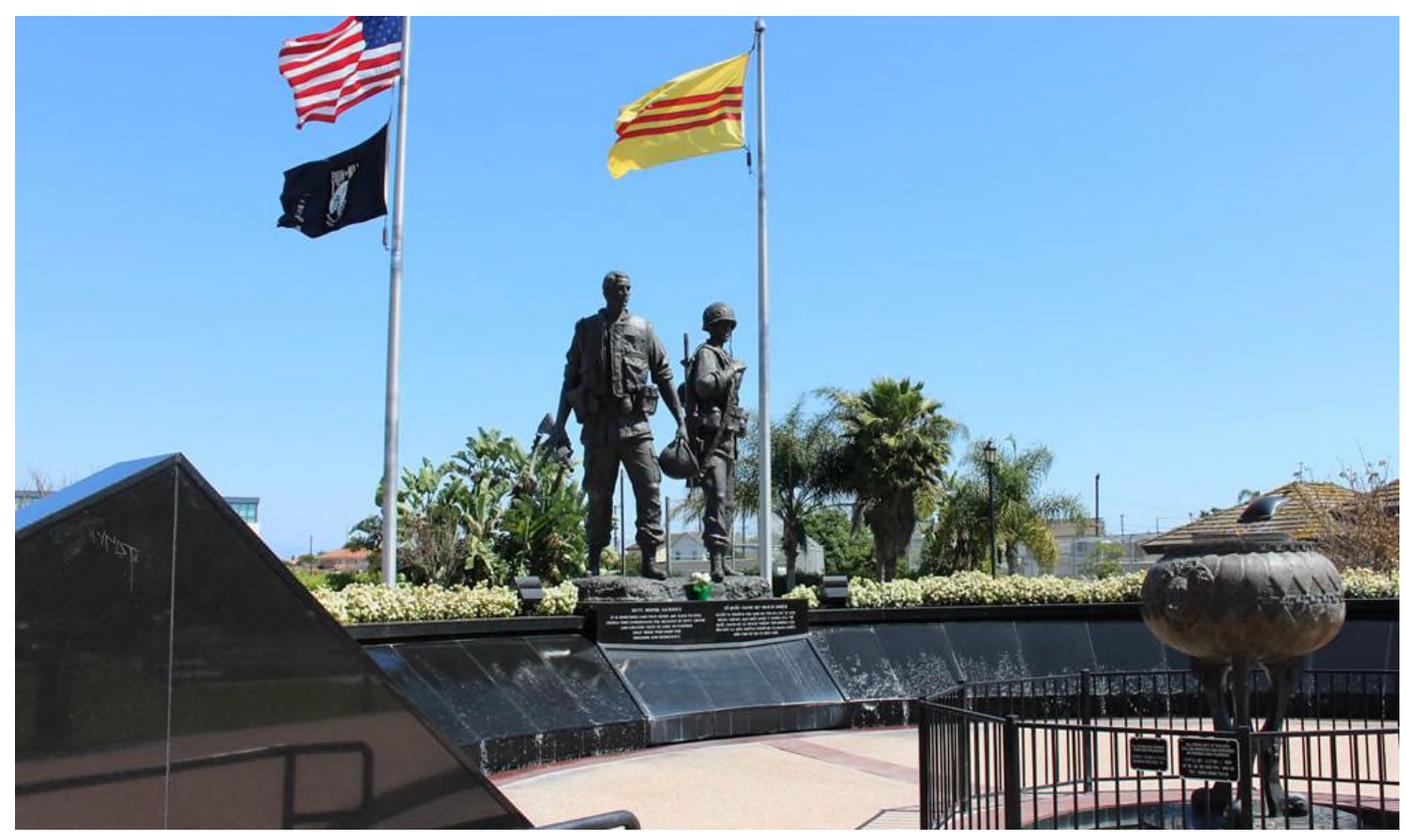
On April 27, 2003, a Vietnam War memorial was unveiled at Sid Goldstein Freedom Park in Westminster.