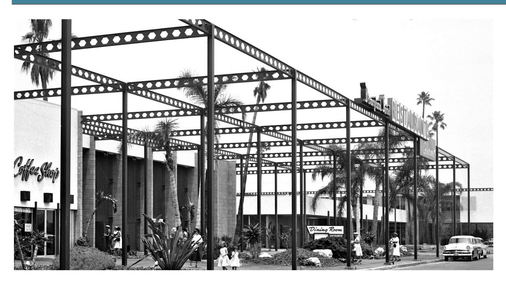
On August 25, 1956, The Disneyland Hotel held its formal opening