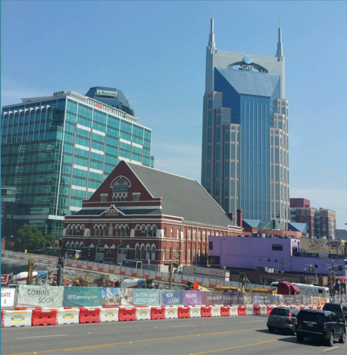
A staff member took this shot of the Memphis skyline in Tennessee while attending the 2017 PRIA Conference.

This section will feature photos taken by department employees while they were out and about to help close our newsletter on a good visual note.