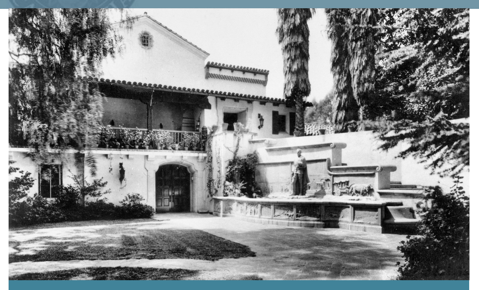
On February 15, 1936, Bowers Museum opened in Santa Ana.