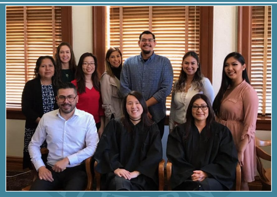
Clerk-Recorder staff at our central location ready to serve the public during one of our special Saturday openings.