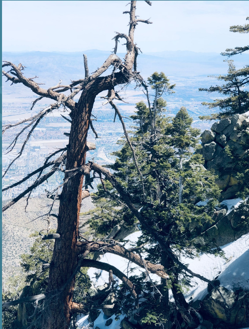
One of our staff took this photo of the landscape atop Mt. San Jacinto State Park.

This section will feature photos taken by department employees while they were out and about to help close our newsletter on a good visual note.